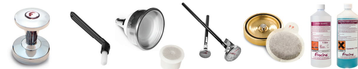
Stainless steel tampers Cleaning brush Capsule Adaptor Milk thermometers ESE Pod Conversion Kit Cleaning Detergent and Milk Cleaner

For other grinders and knock out drawers see: Fracino Grinder Brochure.