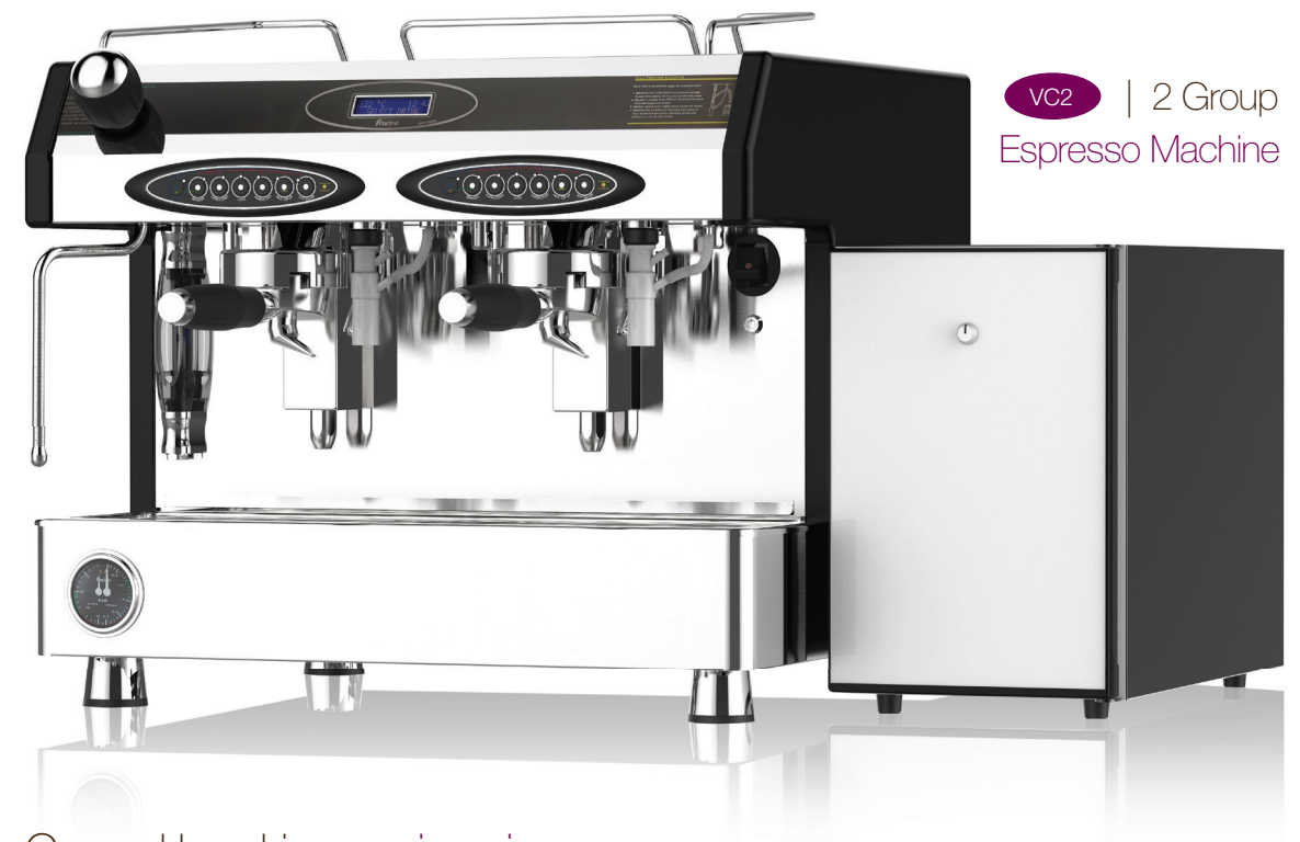
VC2 | 2 Group Espresso Machine