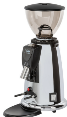
F4 OD Chrome

The F4 series models are manufactured from die-cast aluminium and finished in black, silver or polished chrome. The On Demand models feature a digital display allowing easy grind dose selection and adjustment.