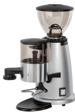
F4 Auto Silver

The F4 series models are manufactured from die-cast aluminium and finished in black, silver or polished chrome. Fitted with an integrated die cast dispenser, to suit different user requirements.