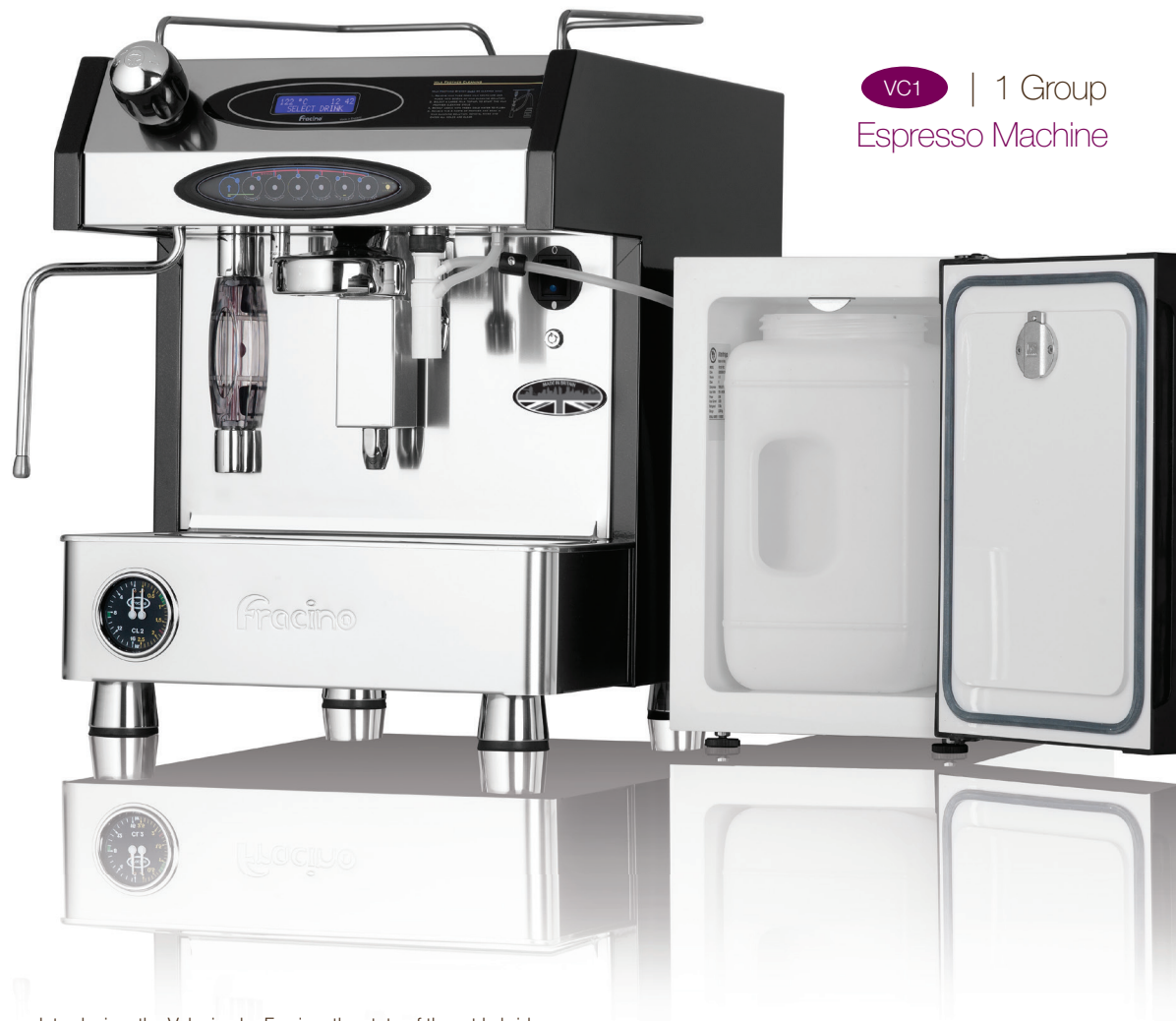
VC1 | 1 Group Espresso Machine

Introducing, the Velocino by Fracino, the state of the art hybrid espresso machine which pairs the convenience of a bean to cup machine, with the simplicity of a traditional espresso machine. Manufactured from the highest quality stainless steel, brass and copper components, it is a reliable and simple to maintain espresso machine, built to last a life time. This no nonsense new innovation has been specifically designed for sites with a high staff turnover, ensuring consistent, premium quality drinks each time, no matter how inexperienced the operator is. Combining the traditional E61 style chrome plated brass group with an automatic milk frother, advanced programming and an easy to understand control panel, the Velocino allows you to dispense all espresso based drinks straight into the cup at the press of a button.